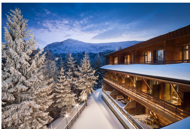
HOTEL MORENI ****

Website | Exact location here Distance from event zone: 16 km Accommodation prices: Double room: BB - 120 BGN, RO - 90 BGN, Single room: BB 95, RO 80 BG More info & reservations: info@hotel-vitoshatulip.com +359882464644. +35924373802