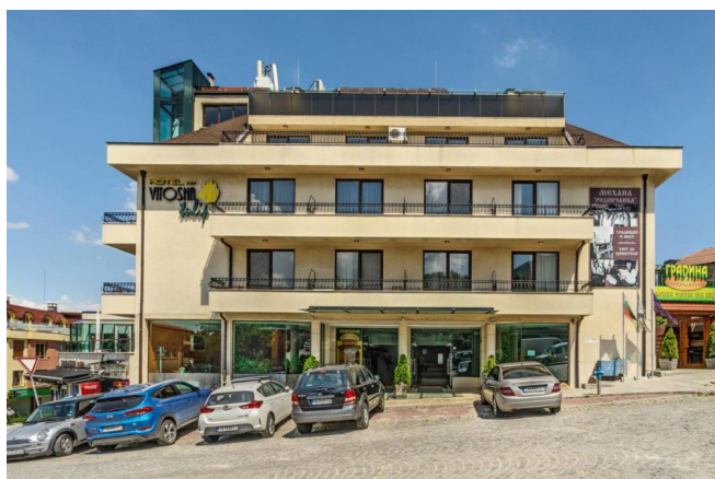
HOTEL VITOSHA TULIP ***

Website | Exact location here Distance from event zone: 16 km Accommodation prices: Double room: BB - 120 BGN, RO - 90 BGN, Single room: BB 95, RO 80 BG More info & reservations: info@hotel-vitoshatulip.com +359882464644. +35924373802